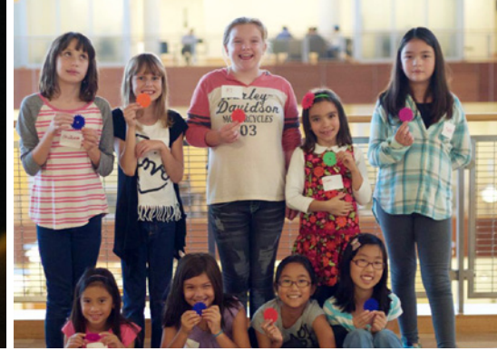
Top left photo courtesy of Justine Bursoni; top right photo courtesy of MakerGirl.